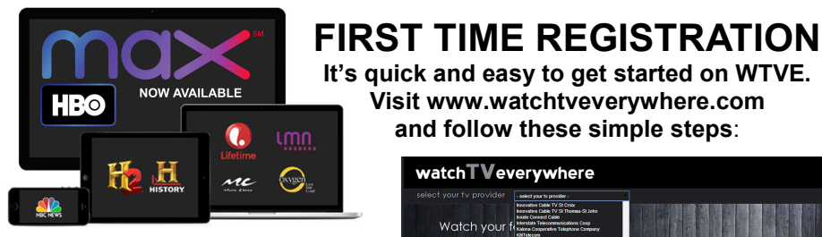
Watch What You Want When You Want!

Step 1: Select Limestone and Bracken Cablevision as your service provider and then choose Register.